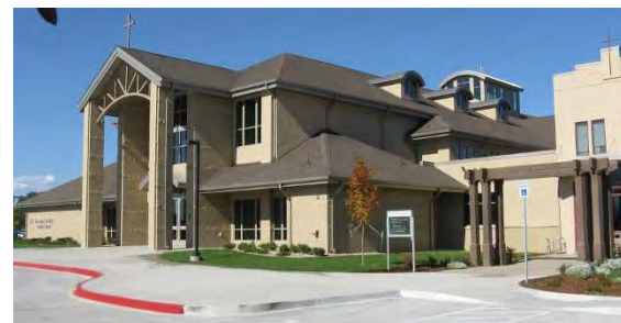
Sixth Sunday in Ordinary Time

Bulletin & Announcement deadline is noon Wed. Feb. 14th for Feb. 25th bulletin.