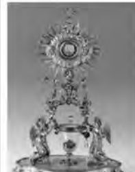
Monstrance containing the Holy Eucharist

“A monastic priest doubted whether the Body of Our Lord was truly present in the consecrated Host. He celebrated Mass and when he said the words of consecration, he saw the host turn into Flesh and the wine turn into Blood. Everything was visible to those in attendance. The Flesh is still intact and the Blood is divided into five unequal parts which together have the exact same weight as each one does separately.