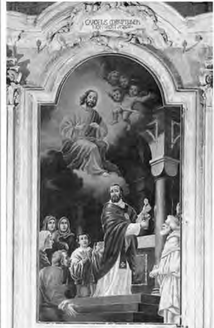
Painting located in the Valacca chapel which depicts the miracle