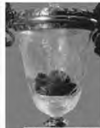
Relic of the wine which was transformed into Blood