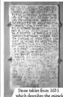
Stone tablet from 1631 which describes the miracle