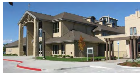
First Sunday of Lent

Bulletin & Announcement deadline is noon Wed. Feb. 21st for March 4th bulletin.